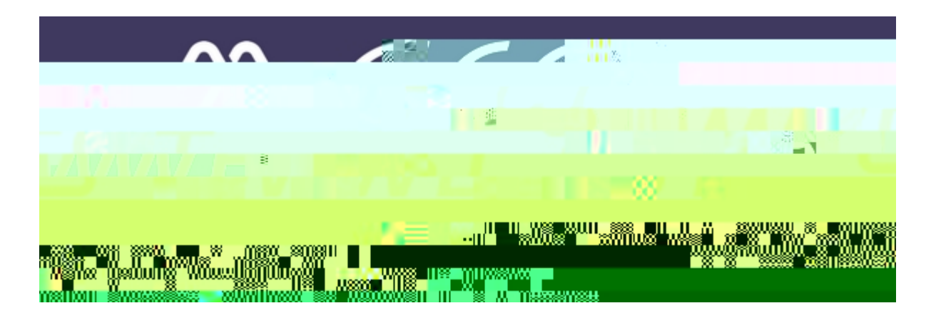
October 13, 2021