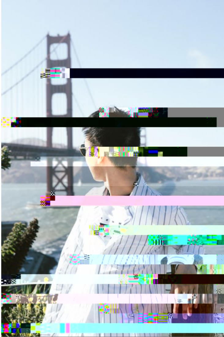
Golden Gate Bridge