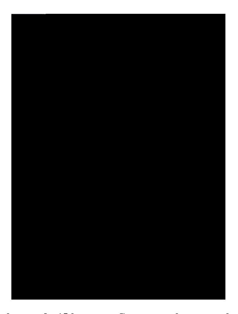
View from the top of a 15th century German castle at a nearby village