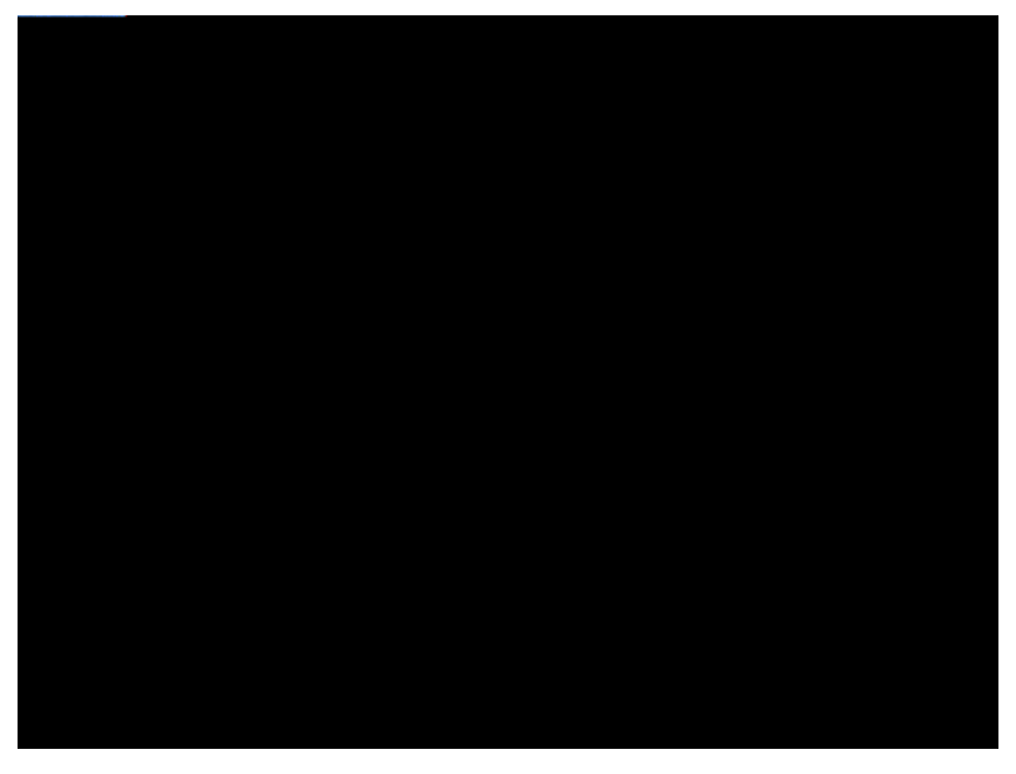
Photograph of the river and the bridge at night