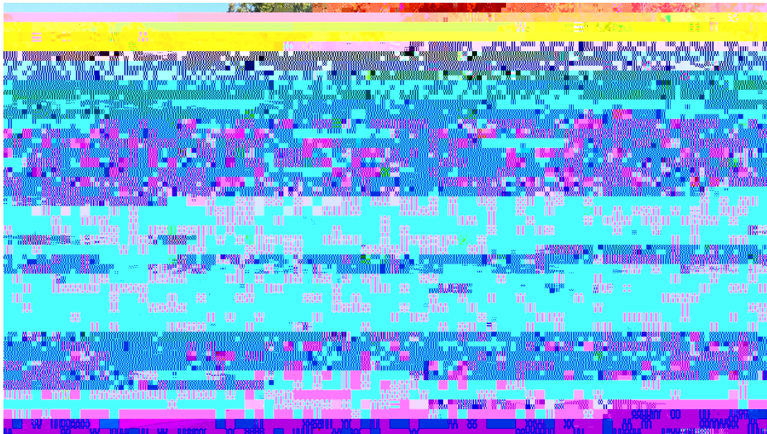
The beautiful school grounds near AF Borgen in Lund.