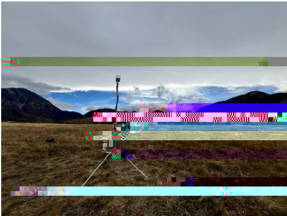
Our Weather Station at Cass Field Station