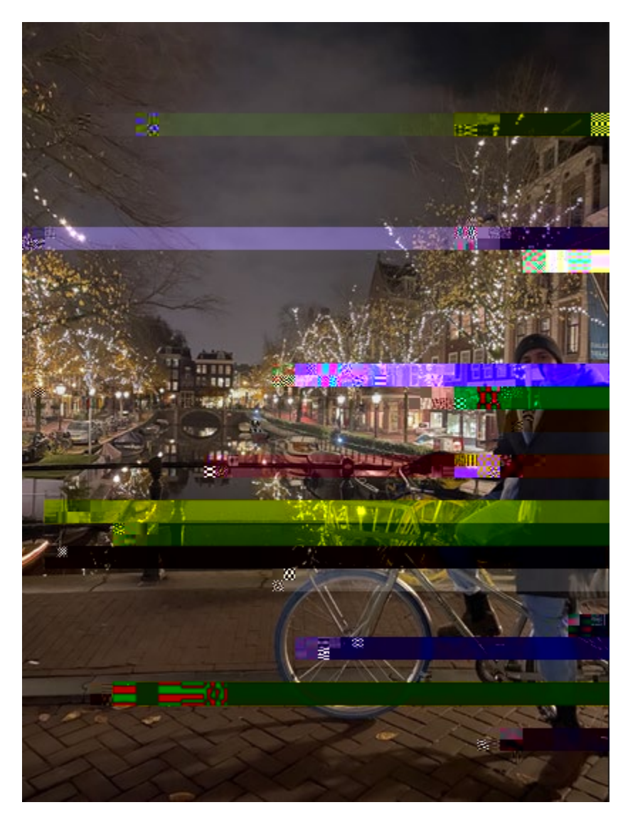
Biking in Amsterdam