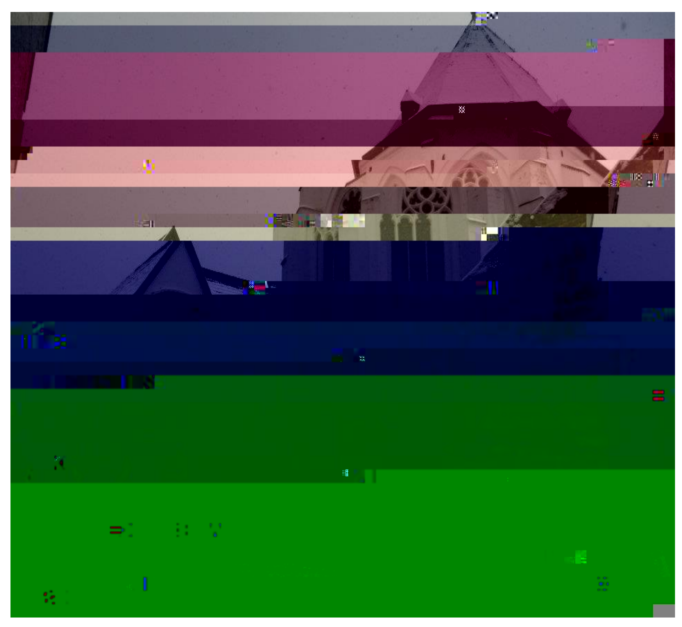
This is Maastricht University College! It used to be a monastery before it was fixed up.