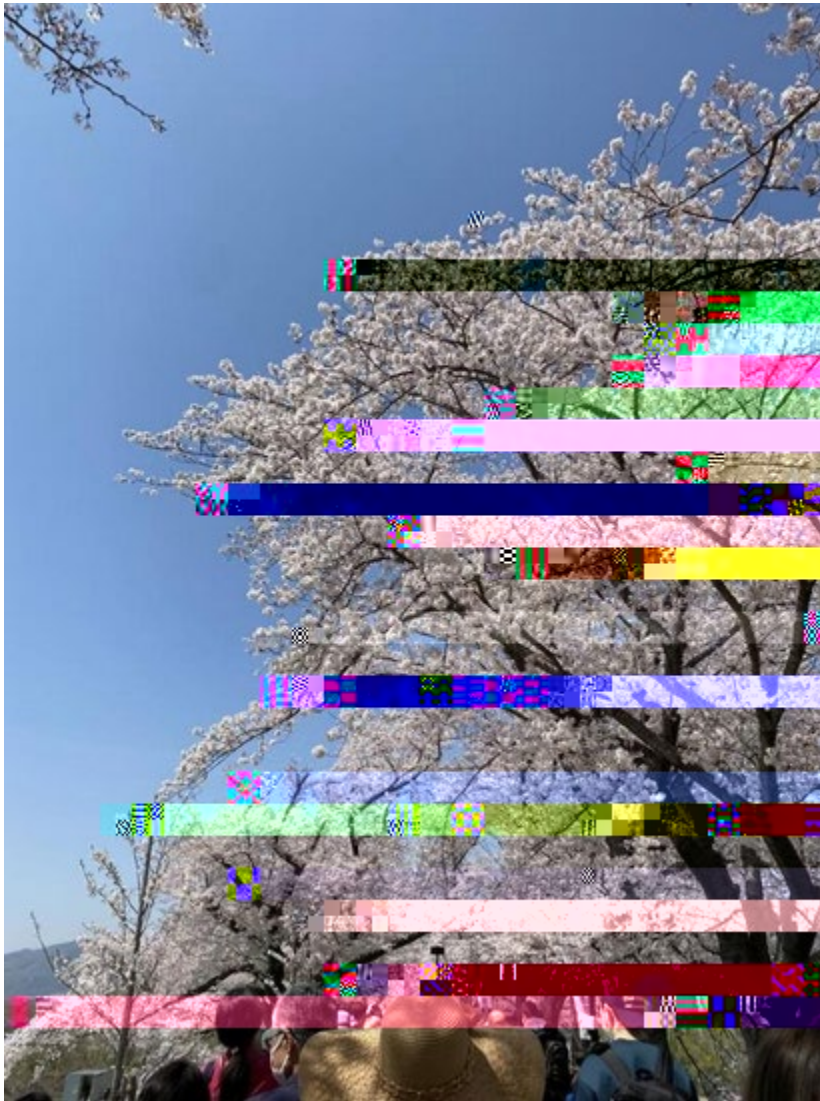
Cherry blossom festival – Kyoto