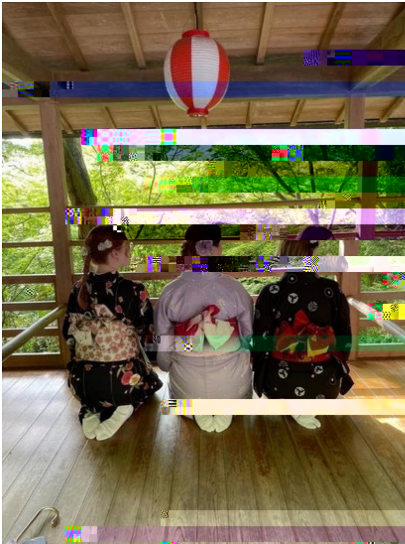
Wearing Kimono with my friends – Kyoto

My advice for other students looking to study abroad is to be confident, push yourself out of your comfort zone, and try new things. Through these steps, although hard at times, I was able to make irreplaceable friends and memories through my time in Japan.