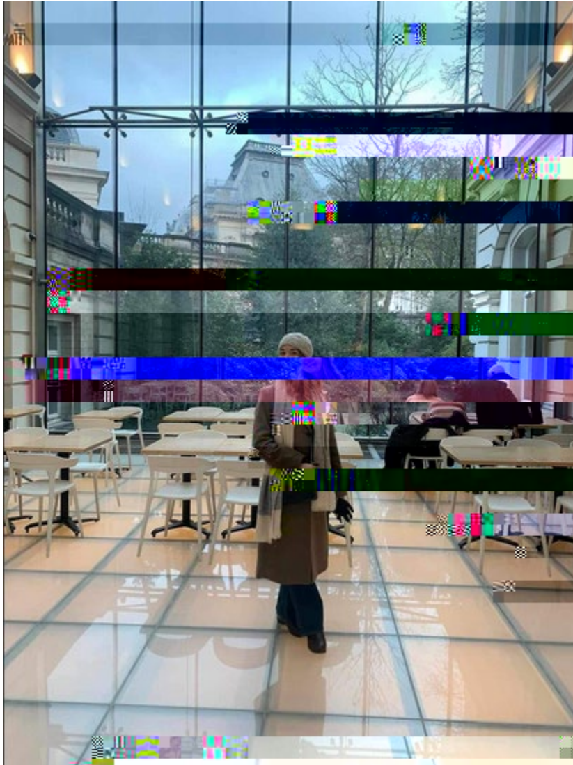
A Visit to Brussels.

A young woman stands in a tiled café, with a window wall as her background. Beyond is a green courtyard surrounded by Romanesque buildings.