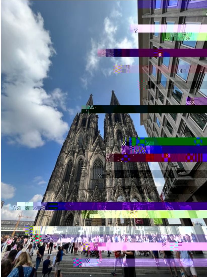
The Cologne Cathedral

An impressive and massive piece of gothic architecture.