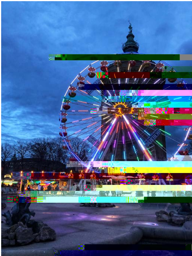
Photo 2- Mannheims Karneval