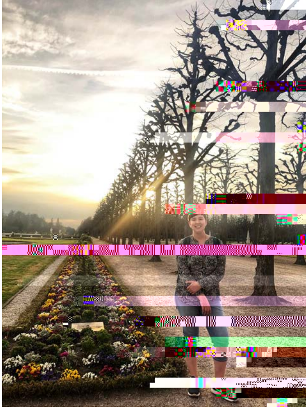
Photo 3- Spring in BadenWürttemberg