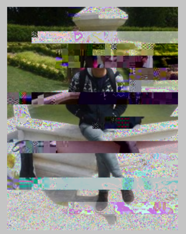
The Parc de Champagne is a great place to hang out with friends (when the weather is nice).