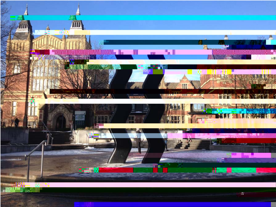
The Grand Hall on campus

Since I lived in a self-catered residence I was given the option to buy a brand-new kitchen pack from my residence, however I ended up buying one second hand for much cheaper from someone on the Leeds Exchange Facebook group. Definitely check the Facebook group before you buy a kitchen pack or any other room accessories as exchange students from the previous semester are often selling things for a good price. I also bought the bedding pack offered by my residence and found it was very scratchy and not very good. Some of my friends bought bedding on their own from inexpensive stores such as Primark and got a much better deal. One thing I did do was buy a cheap quilt/duvet from Primark and put it on my mattress under my fitted sheet to make my bed more comfortable and it was the best money I spent in Leeds.