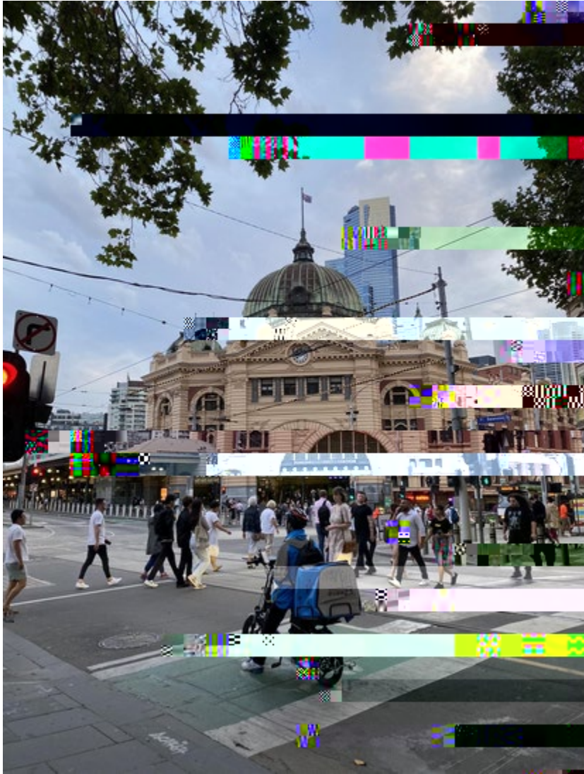
Flinders Street Station