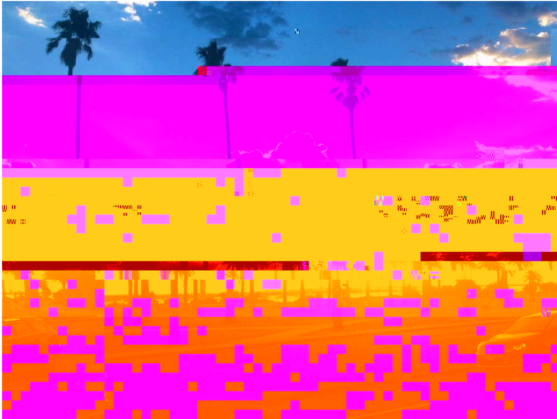
Road trip from Brisbane to Noosa