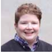
AYE YL BANC OFF Event & Volunteer Coordinator