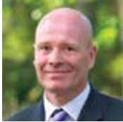
ILI S EENKAM VP, External Relations